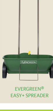
EVERGREEN® EASY+ SPREADER