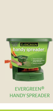
EVERGREEN® HANDY SPREADER