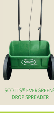
SCOTTS® EVERGREEN® DROP SPREADER