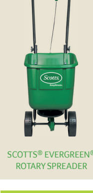
SCOTTS® EVERGREEN® ROTARY SPREADER