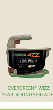
EVERGREEN® WIZZ YEAR-ROUND SPREADER